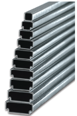
Available in standard widths 6.35 mm to 25.4 mm

Dramatic condensation resistance improvements are realized through utilization of TGI-Spacer, enabling windows to attain their highest thermal performance.